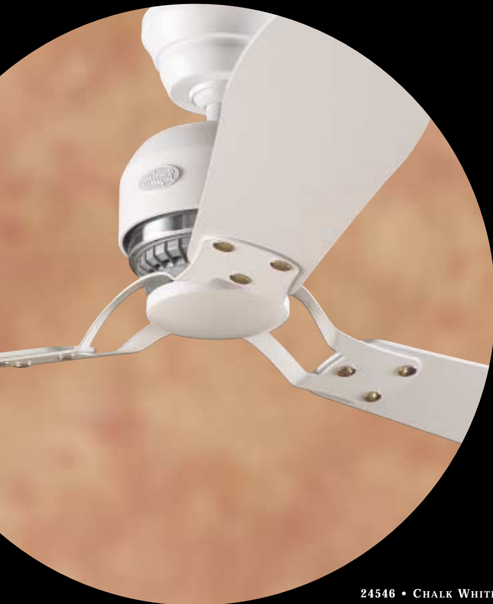
24546 • CHALK WHITE WITH THREE WHITE/MAPLE BLADES