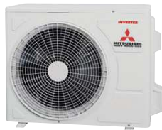
SRC15ZTL-W, SRC20ZTL-W, SRC25ZTL-W, SRC35ZTL-W